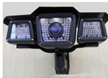
Be installed in gun camera

Standard M12 Lens Application situation and actual pictures show