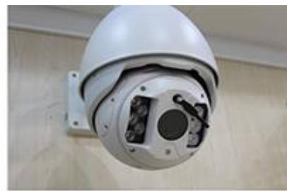
Be mounted in spherical camera